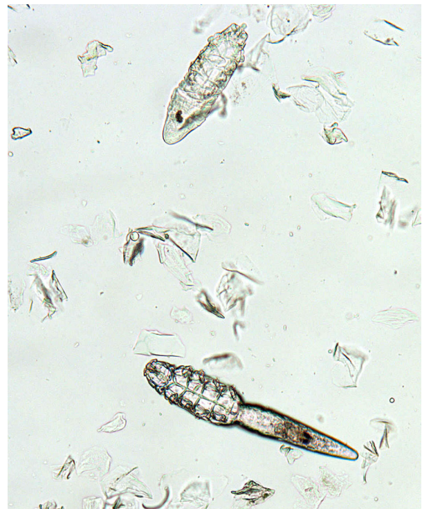
Figure 9. Demodex canis mites in a skin scraping ( \times 100 ).

Trichograms have been reported as an alternative to deep skin scrapings 79,80 and are particularly useful in areas that are difficult to scrape, such as periocular and interdigital areas. An area of 1 cm 2 should be plucked with forceps in the direction of the hair growth and placed in a drop of mineral or paraffin oil on a slide. The use of a coverslip greatly facilitates thorough and rapid inspection of the specimen (Figure 10). To increase the chance of a