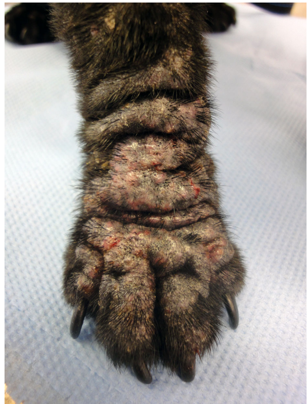
Figure 3. Pododemodicosis in a 1-year-old, male neutered pug with generalized demodicosis.

Demodex cati can cause localized or generalized disease and lesions include erythema, hypotrichosis/alopecia,