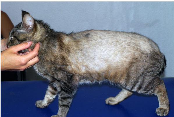
Figure 7. Alopecia due to Demodex gatoi in a DSH.