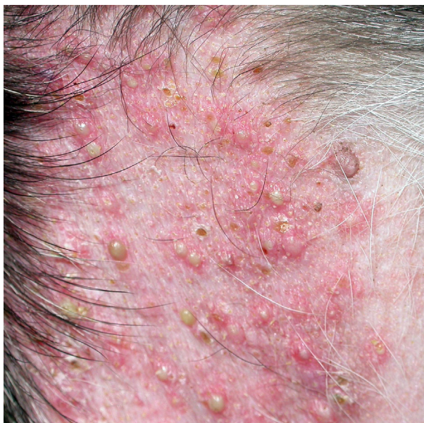
Figure 4. Pustular demodicosis on the ventrum of a dog with generalized demodicosis.

Deep skin scrapings are considered to be the diagnostic tool of choice in most patients with suspected demodicosis. 78 Samples may be collected with curettes, spatulae, sharp or dull scalpel blades. Placing a drop of mineral oil