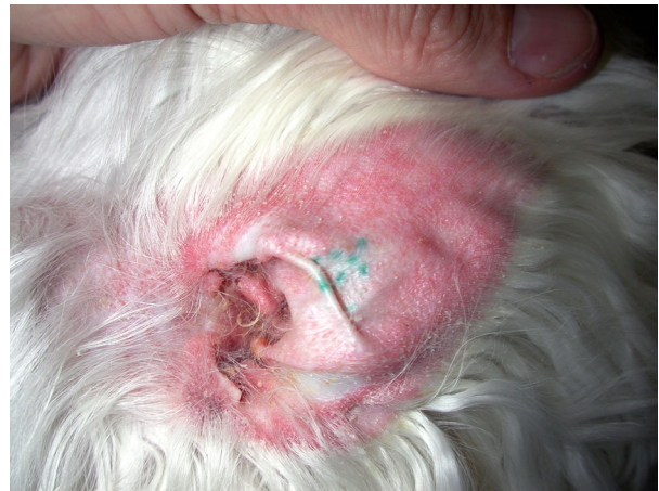
Figure 2. Erythematous and scaly pinna of a dog with demodicosis.

similar to D. canis , the most striking and consistent clinical feature is marked greasiness of the dorsal trunk.