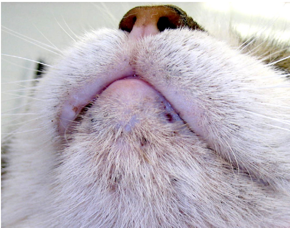
Figure 6. Demodicosis caused by Demodex cati in an 8-year-old female spayed domestic short-haired cat with lymphoma.