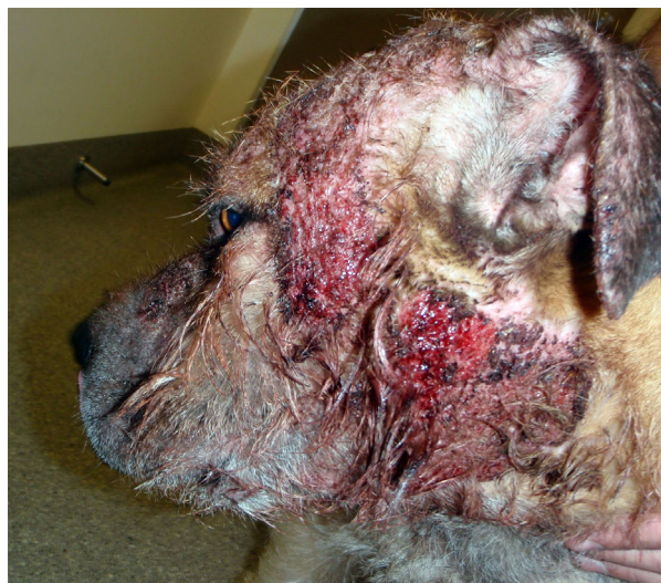
Figure 5. Severe facial demodicosis in a dog.

As Demodex mites are part of the normal microfauna, one mite identified on several deep skin scrapings could be a normal but uncommon finding. However, more than one mite is strongly suggestive of clinical demodicosis. If only one mite is found in a dog with compatible clinical signs, further skin scrapings should be performed to confirm the diagnosis. Different life stages (eggs, larvae, nymphs and adults) and their numbers should be recorded and compared from the same sites at each visit to objectively measure the treatment success.