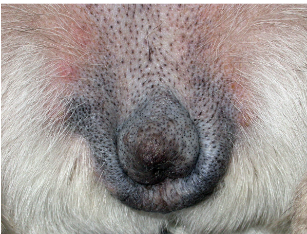
Figure 1. Comedones in the perivulval area of a dog with demodicosis.

Demodex injai has been reported in several dog breeds but seems over-represented in terrier breeds and their crosses. 60 Whilst it may be associated with erythema, comedone formation, hyperpigmentation and alopecia,